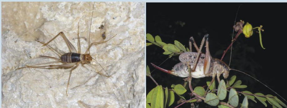
Two examples of long-horned grasshoppers: on the left the recently described endemic cave-cricket Socotraxis kleukersi , on the right the endemic bush-cricket Pachysmopoda abbreviata .