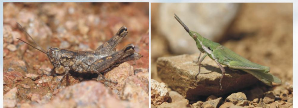
Two examples of short-horned grasshoppers. Left: the endemic Dioscoridus depressus . Right: Pyrgomorpha conica .

On Socotra there are approximately 50 species of Orthoptera. The island has a very high degree of endemism. More than half of them can be found nowhere else on earth, except on Socotra. And of the 38 known genera of Socotra, 8 are endemic. The total number of species known on Socotra will rise slightly in the near future. Some species found during recent studies in 2009 and 2010 have not been identified yet and are certainly new for the island.