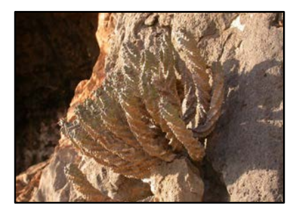
Euphorbia spiralis / Qisho Endemic. Soqotra's only spiny succulent plant, with stems sometimes twisted into a spiral. The latex will cause skin to blister.

There are several endemic hibiscus shrubs on Soqotra. Be careful! If touched they shed star-shaped hairs that cause swelling and itching.