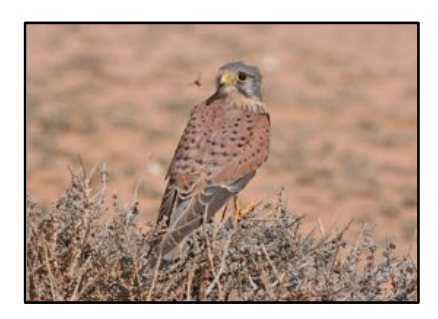
Common Kestrel Falco tinnunculus Wing-span 75cm. The smallest bird of prey on Soqotra. Feeds on insects and lizards.