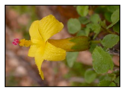
Hibiscus / Diraffan

The deep-red flowering bloom of a Caralluma is one of the most attractive sights on Soqotra. The flowers and growing tips can be eaten.