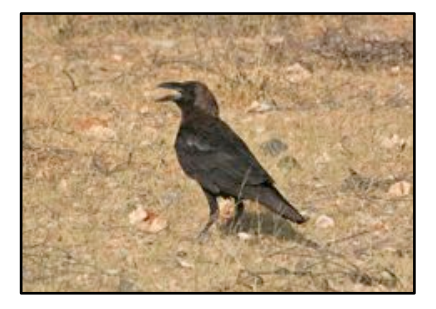
Brown-necked Raven Corvus ruficollis Wing-span 50cm. The only large, black bird on Soqotra. Near the airport is a good place to see it.