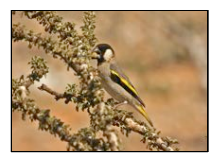
Socotra Golden-winged Grosbeak

Rhynchostruthus socotranus Wing-span 15cm. Yemen's National bird. Cracks nuts with its bill.