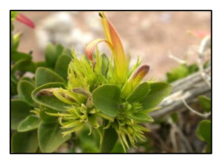
Trichocalyx / Al'hal Endemic. One of Soqotra's 13 endemic plant genera, with 2 species. The flowers are sucked for their sweet nectar.