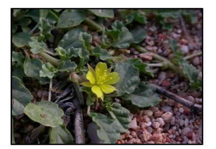
Corchorus depressus / Irsib A small herb with yellow flowers and linear fruits. The leaves and roots of both Corchorus species can be eaten raw or on cereal as a relish.