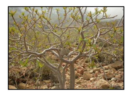
Jatropha / Sibru Jatropha unicostata One of the most common shrubs on the island. The sap is used to treat cuts, burns and bites but is poisonous if ingested.