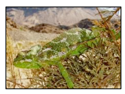
Socotran Chameleon Chamaeleo monachus A relict nocturnal species. Near Threatened and listed in CITES. Aggressive if disturbed.