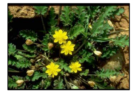
Corchorus erodioides / 'Irsib Endemic. A rosette-forming herb with bright yellow flowers. One of Soqotra's most common endemics.