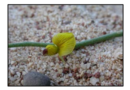
Crotalaria persica A small shrub in the pea family. On Soqotra it is only known from Di-Hamri – DO NOT DISTURB!