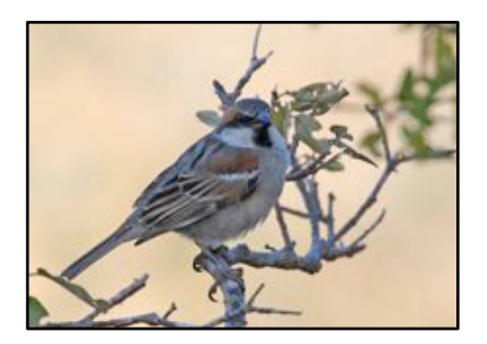
Socotra Sparrow Passer insularis Wing-span 15cm. Very common throughout Soqotra, the only place in the world that it is found. Often seen in flocks.

Somali Starling Onychognathus blythii Wing-span 35cm. Often seen in flocks flying over woods and villages. The female (here) has a grey head.