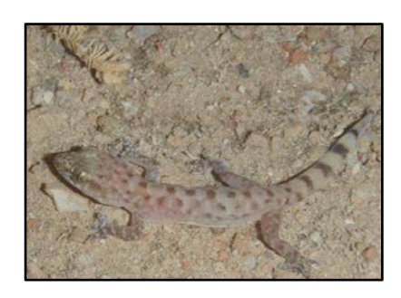
Arabian Leaf-toed Gecko Hemidactylus homoeolepis The most widespread and common nocturnal reptile; under rocks in the daytime.