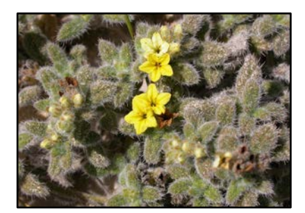
Heliotropium socotranum / Hariher

Endemic. This low herb, with its white and yellow flowers, is perhaps the commonest of the endemics at Di-Hamri.