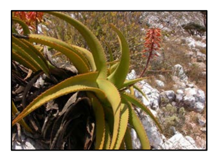
Aloe / Tayf Endemic. Soqotra has 3 endemic species of Aloe . As with the famous Aloe vera , Soqotra's Aloes are valued for their medicinal uses.

Soqotra is famous for its unique flora. While several of its trees are world famous, some of its smaller plants are just as interesting. Here are some plants that you may see during your visit. Many of Soqotra's plants are vulnerable to extinction; please do not disturb or collect any parts of plants, including seeds.