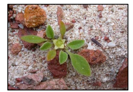
Aizoon canariense / Kibidinoh This tiny herb with star-like fruits is common on sandy plains throughout Arabia. An important dry season forage where little else grows.

The stems of this greyish vine trail for up to a meter across the sand; it is related to the water melon but the flesh of the fruits is extremely bitter. Goats eating the fruit are said to go longer without water, but the fruit has many toxins with strong purgative effects.