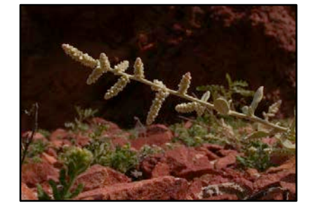
Aerva javanica / Fe ' A medium-sized herb with cotton like flowers which is common throughout Soqotra and Arabia.