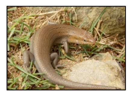
Socotra Skink Trachylepis socotrana Diurnal skink. Common and widespread, even in urban areas (rockwalls).