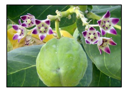
Calotropis procera / I 'ish'hur A large shrub with milky latex, pretty flowers and swollen fruits. The latex can be used to treat a painful tooth and to expel worms.