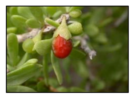
Lycium socotranum / Su'hur Endemic. This spiny shrub with its fleshy orange fruits is widespread on the plains of Soqotra. The berries can be eaten raw or as a porridge.