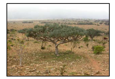
Euphorbia / Imteh Euphorbia arbuscula Endemic. The latex of this tree is poisonous but can be use as a glue and insect deterrent.

The red resin has many uses including the decoration of pottery.