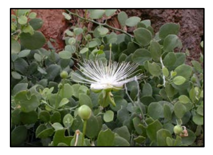
Capparis cartilaginea / Lizafih Easily noticed, untidy shrub that grows from cliffs and boulders around the island. Its large flowers attract honey bees.

Found among rocks and the base of shrubs in open woodland. A succulent with large, foulsmelling flowers. Also found in Africa.