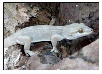
Dragon's Blood Tree Gecko Hemidactylus dracaenacolus Nocturnal. Found only on the dragon's blood tree. Critically Endangered.