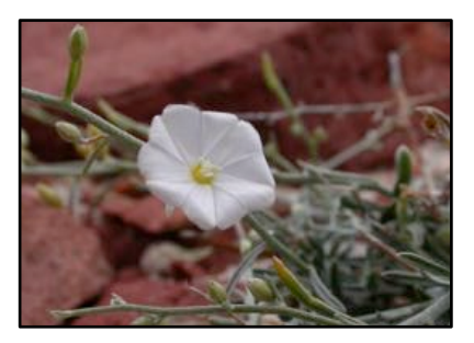
Convolvulus rhynoiospermus / Noy

Endemic. A mat-forming plant with silvery leaves. An important animal food.