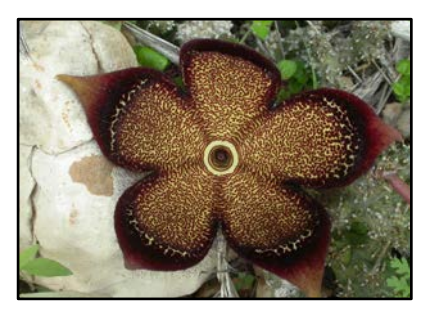
Edithcolea grandis / Mish'hermihim

Found among rocks and the base of shrubs in open woodland. A succulent with large, foulsmelling flowers. Also found in Africa.