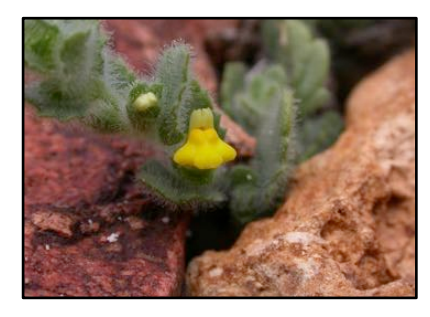
Lindenbergia socotrana / Ru'ud Endemic. A small shrub with tiny "2-lipped" flowers.