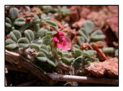
Indigofera nephrocarpa / Tifher A small mat-forming pea with tiny pink flowers and minute fruits and leaves. A valued and nutritious fodder plant.