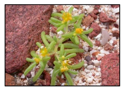
Tetraena simplex / Qalqihal A widespread herb with minute succlent leaves. In water-poor regions the fleshy leaves and stems can be crushed and the liquid used for washing and cleansing.