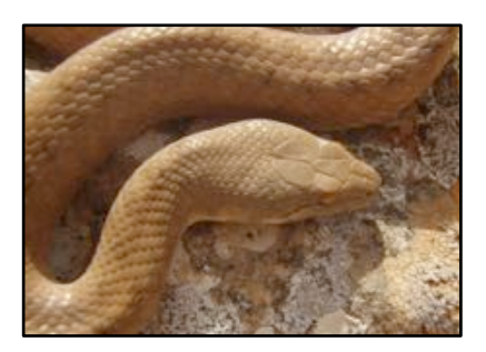
Günther's Racer Ditypophis vivax A relict nocturnal species. Harmless though viper-like in appearance. Eats mice.

In total, 31 species of reptiles have been recorded on Soqotra Archipelago, including 29 that are found nowhere else in the world. Of those, 35% are Threatened, Near Threatened or Data Deficient, including the dragon's blood tree gecko. This leaflet shows some that are endemic and easy to spot, all non-poisonous.