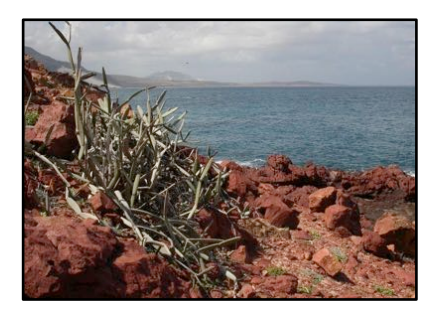
Cissus subaphylla / 'Atirheh Endemic. This rather straggly shrub is common on the coastal plains. The ash of burned stem s may be used both to treat ulcers and to cure leatherwork.