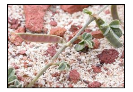
Tephrosia uniflora / Tifher A ground hugging pea.