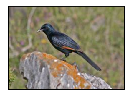
Socotra Starling Onychognathus frater Wing-span 30cm. Much rarer than the Somali Starling; Soqotra is the only place it is found in the world.