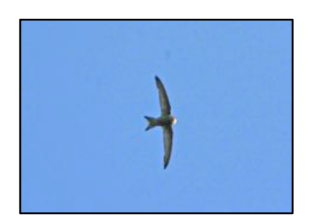
Forbes-Watson's Swift Apus berliozi Wing-span 17cm. The only swift likely to be seen – often in large flocks, though it is not common.

Socotra Scops Owl Otus socotranus Wing-span 21cm. Listen for its call at night: woup-woup dapwoorp. Soqotra is the only place it is found in the world.