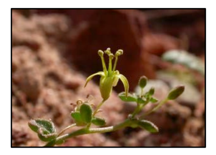
Cleome brachycarpa / Tamirhen

A tiny herb with star-like, yellow flowers. Leaves can be strewn in bedding to provide a nice smell.