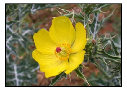
Argemone mexicana / Miranniha Invasive species. The Mexican poppy is not native to Soqotra but dominates in some disturbed areas.