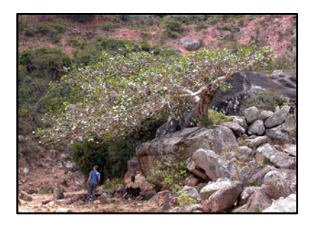
Fig / Tiq Ficus vasta Found across the island and said to indicate the presence of water. The sticky latex is used to treat fractured bones.

Frankincence / Ameero Boswellia Soqotra has 7 Boswellia species, all are endemic. Frankincense is dried gum that is extracted from the bark.