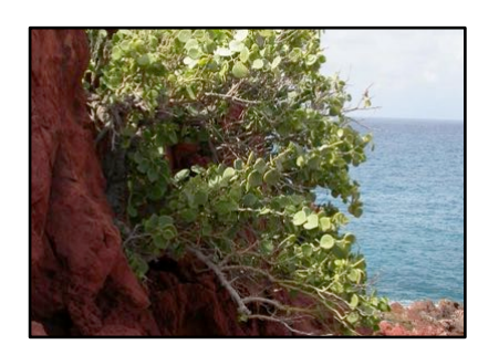
Capparis cartilaginea / Lizafih

Endemic. This low herb, with its white and yellow flowers, is perhaps the commonest of the endemics at Di-Hamri.