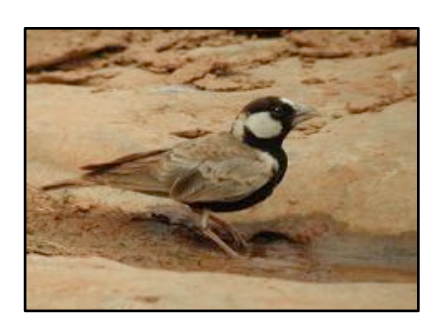
Black-crowned Sparrow-lark Eremopterix nigriceps Wing-span 12cm. Can be seen in large flocks in sandy areas, often close to roads.