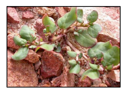
Zaleya pentandra / Hidis Rather nondescript, weedy plant with inconspicuous flowers. The leaves may be used to repair clay pottery.