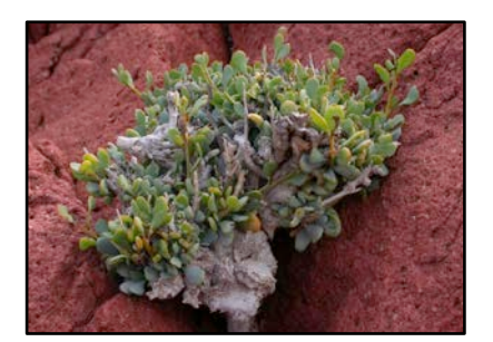
Aerva microphylla / Fe ' Endemic. This small shrub is widely distributed on coastal cliffs. The roots of both species are ground and can be used to treat eye complaints and as a hair dye.

Coastal Plants of Di-Hamri Marine Protected Area (2) "The Place of the Two Peaks"