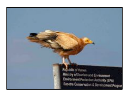
Egyptian Vulture Neophron percnopterus Wing-span 150cm. Tame. Globally endangered but common on Soqotra.

Over 220 species of birds have been recorded on Socotra, including 11 that are found nowhere else in the world. 5 are Globally Threatened, including the widespread Egyptian Vulture. Here are some that are special and familiar.