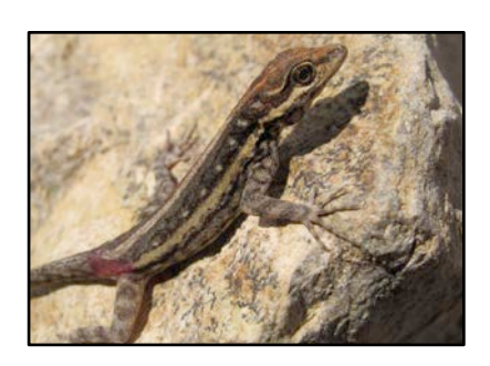
Socotra Rock Gecko Pristurus sokotranus The commonest diurnal reptile. Rock-dwelling. Signals with the tail.