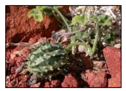
Cucumis prophetarum subsp. prophetarum / Di-Ah'shawih

Another melon relative with softly spiny, green and white fruits. The fruit can be stuck onto a finger as a dressing.