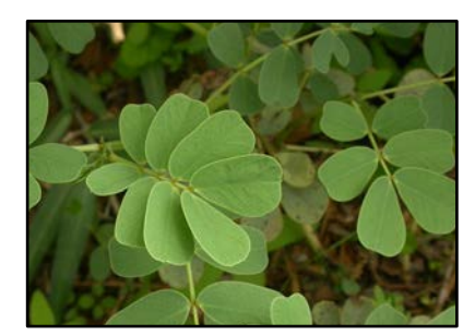
Senna holosericea / Feriro Commonly seen legume The dried, ground leaves are mixed with water and used as a digestive cleanser or laxative.