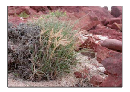
Cymbopogon jwarancusa / Dhowtiynih

Lemon-grass. Pieces of the green plant can be added to the fire to increase the flavour of the cooked food.