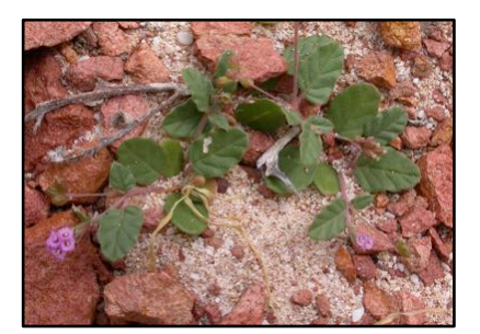
Boerhavia diffusa / Hidiho A creeping herb with minute pale pink flowers. The roots may be eaten either raw or cooked.