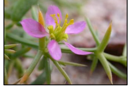
Fagonia paulayana / Giyrbeb A long spiny herb with sharp prickles and pretty pink flowers. A paste made from the heated crushed plant can be used to treat cracked feet.