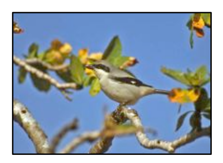
Socotra Grey Shrike Lanius meridionalis Wing-span 25cm. Eats large insects and lizards, which it impales on thorns for a 'larder.'