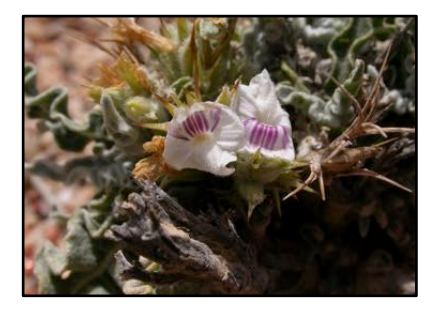
Neuracanthus aculeatus / Hamahamo Endemic. This low spiny subshrub is common at Di-Hamri but rare elsewhere. Dead plants can be used as tinder and fire lighters.