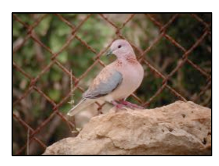
Laughing Dove Spilopelia senegalensis Wing-span 25cm. Widespread and very common where there are trees.