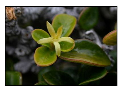
Cryptolepis intricata / Gissoh This small shrub, with its tiny yellow flowers and glossy green leaves, is widespread but highly variable in form.