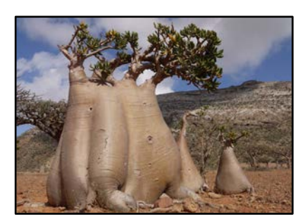
Desert Rose / Tiriymo or Isfid Adenium obesum Endemic subspecies. One of Soqotra's famous bottle trees. Widespread and abundant across the island.

More than 100 of Soqotra's 807 plant species are trees. Many of them are found only on Soqotra and some are very rare. Here are some of the highlights and common species you'll see on your trip. The Ethnoflora of the Soqotra Archipelago (Miller & Morris 2004) is a main source of information.