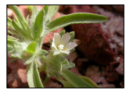
Convolvulus sp. A small annual herb still requiring identification.

Endemic. A mat-forming plant with silvery leaves. An important animal food.