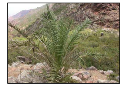
Date Palm / Timirih Phoenix dactylifera Although not native the date palm is the most important tree for the islanders. Dates are a staple food on Soqotra.